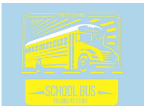
C Pilot School Busing

The total project cost was approximately $25,000.