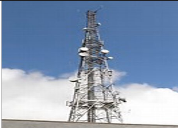
J. Silicon Valley Regional Interoperability Project (SVRIP) Service