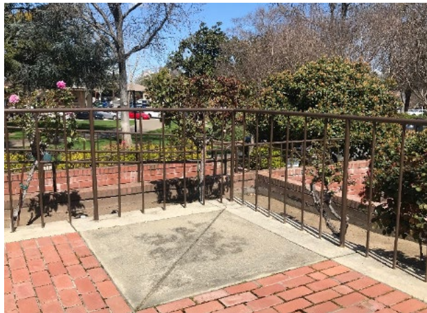
H Plaza Level Railings – Code Upgrade

The total project cost was approximately $49,000.