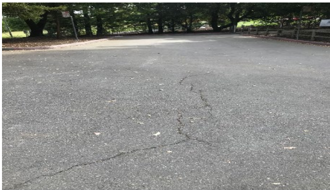
D Creek Trail & Park Pathway & Parking Lot Seal Coat Striping

The project resurfaced and restriped park parking lots, pathways, and sections of the Los Gatos Creek Trail.