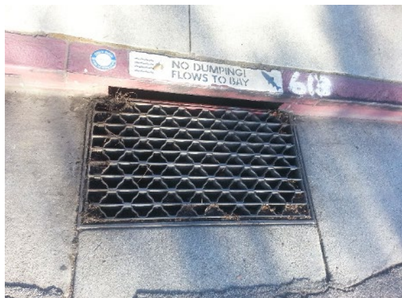
A Stormwater Master Plan