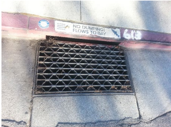
A Stormwater Master Plan