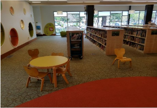
G Library Carpet Replacement