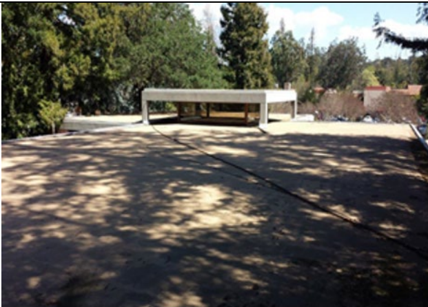
I Police Headquarters Roof Repair

The total project cost was approximately $33,000.