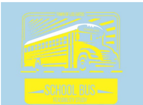
C Pilot School Busing

The total project cost was approximately $25,000.