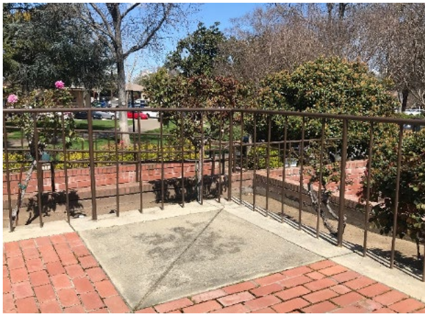
H Plaza Level Railings – Code Upgrade

The total project cost was approximately $49,000.