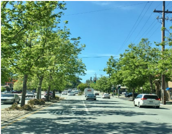
B Public Art Gateway

The total project cost was approximately $219,000.