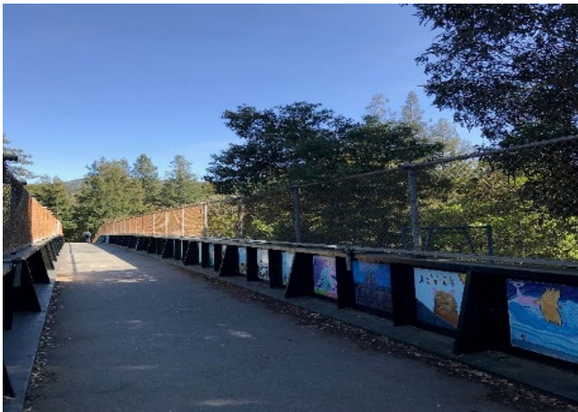
E Forbes Mill Footbridge Improvements

The total project cost was approximately $229,000.