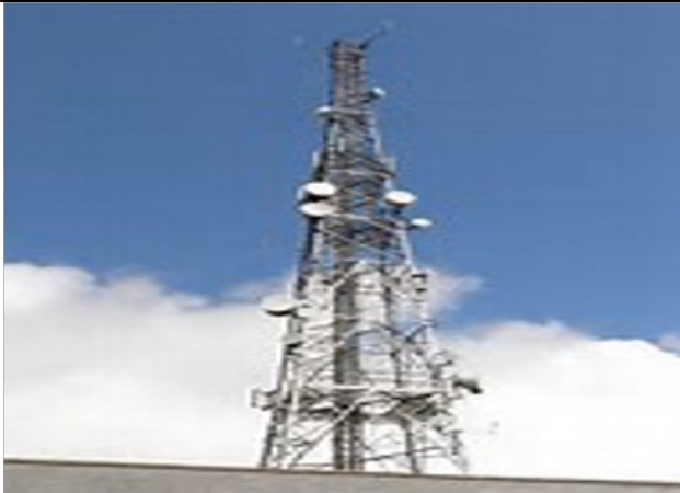
J. Silicon Valley Regional Interoperability Project (SVRIP) Service