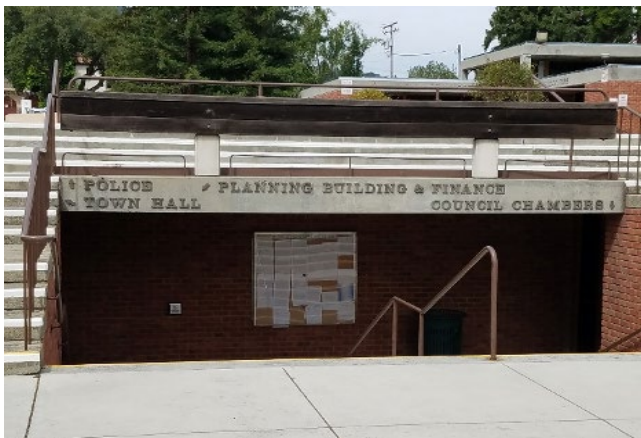
F Facilities Assessment

The total project cost was approximately $28,000.