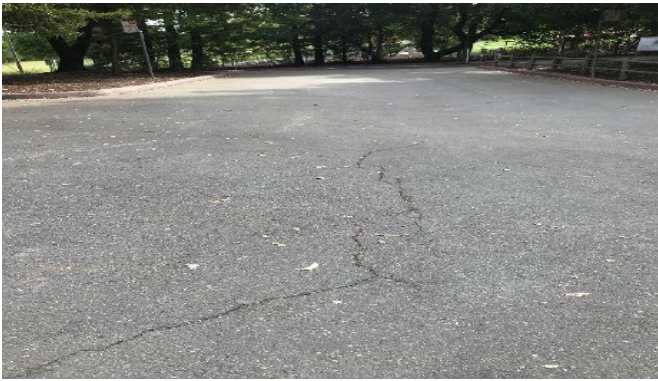
D Creek Trail & Park Pathway & Parking Lot Seal Coat Striping