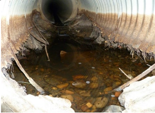
D Bicknell Road Storm Drain Improvements