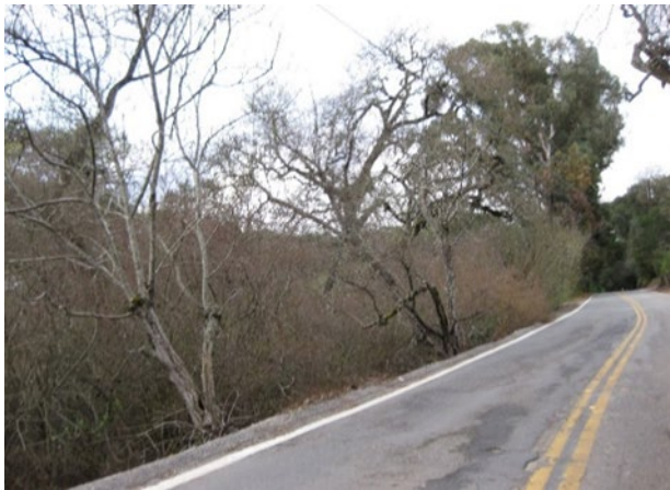
B Guardrail Replacement

The total project cost was approximately $44,000.