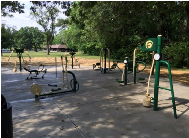
A Outdoor Fitness Equipment