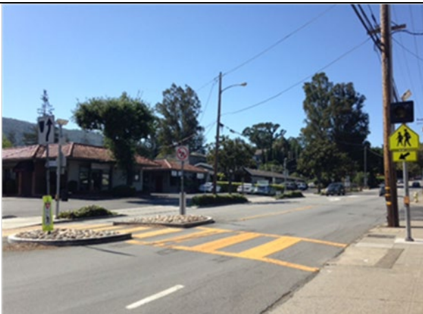
C Massol Intersection Improvements

The total project cost was approximately $920,000.