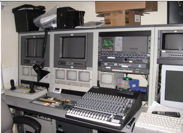
E Audio/Video System Upgrade

The total project cost was approximately $183,000.